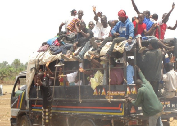
Group from Fintonia leaving for 3 day journey back home