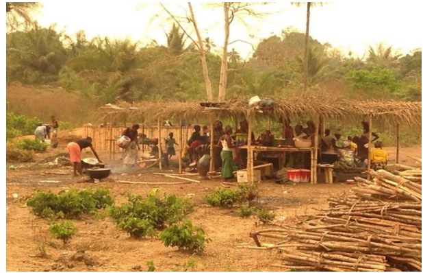
Kitchen for Rokassa General Assembly