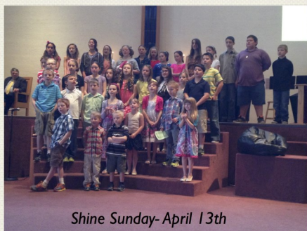
Shine Sunday- April 13th