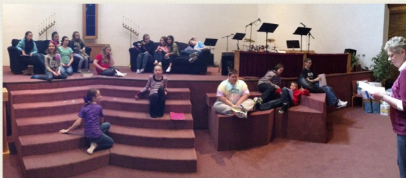
5-6th preparing drama