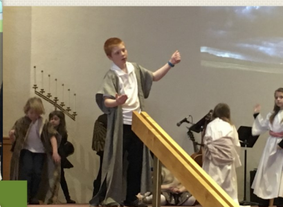
Blessed be the name of the Lord, Blessed be Your glorious name.