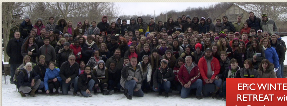
EPiC WINTER RETREAT with the Presbytery of the Alleghenies