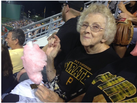
FAITH NIGHT TRIP 2015