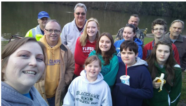
BRADY'S RUN YOUTH OUTREACH