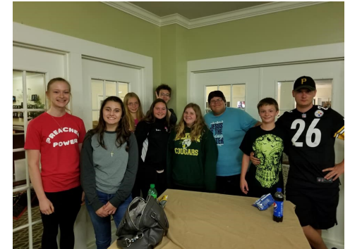
ELMCROFT GAME NIGHT