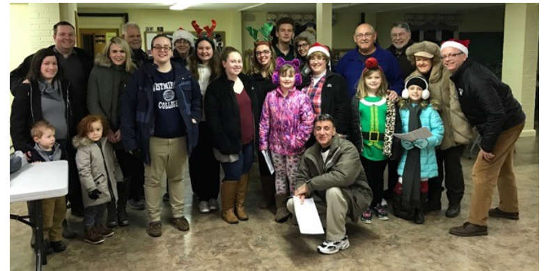
CAROLING GROUP 2016