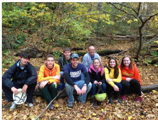
CONFIRMATION CAVING TRIP 2015