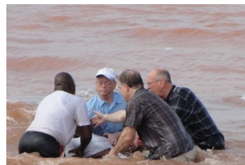
SIERRA LEONE BAPTISM - ATLANTIC OCEAN