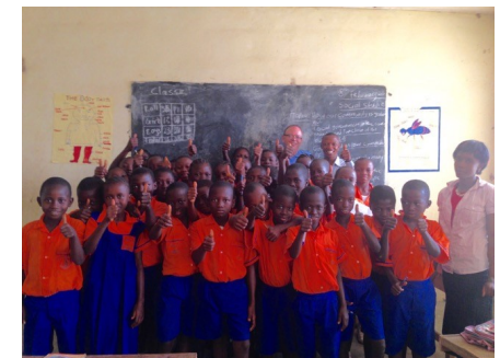
FINTONIA ELEMENTARY SCHOOL CLASS