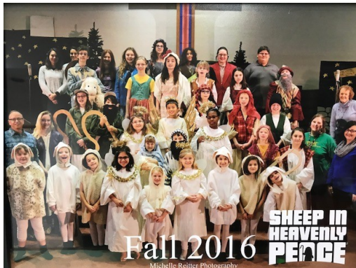
SHINE CHRISTMAS PROGRAM