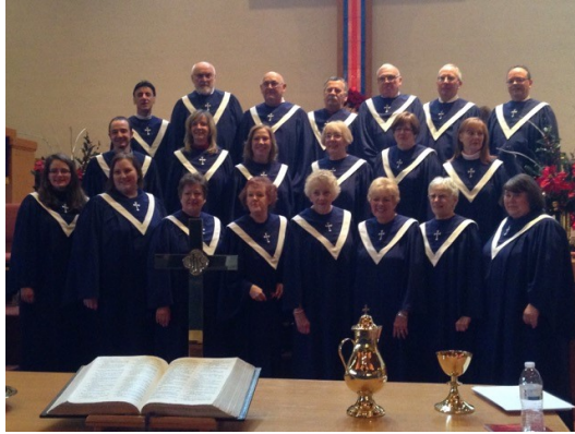
CUP CHOIR 2014