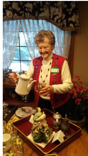
CHRISTMAS TEA 2016