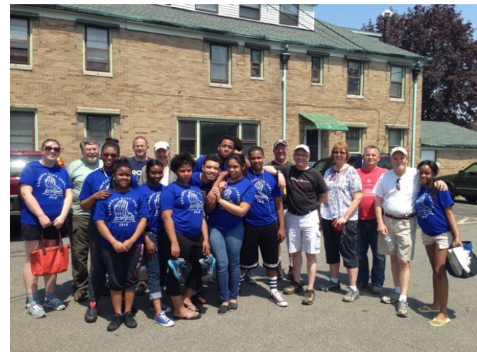
MISSION TRIP TO CLEVELAND 2015