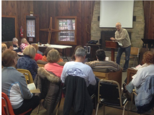
CUP ALL CHURCH RETREAT AT CAMP FREDERICK 2015