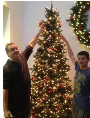
CHURCH DECORATING 2014