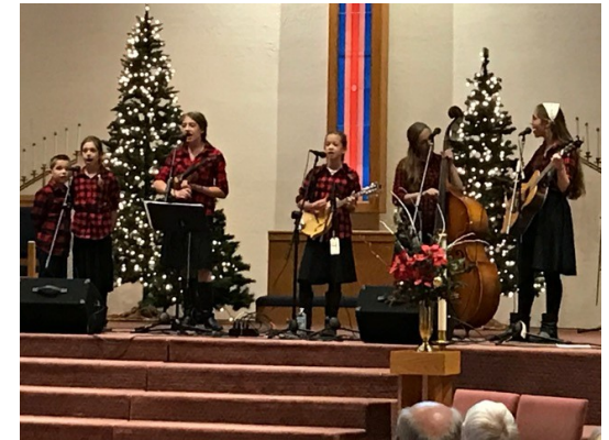
ECHO VALLEY CONCERT 2016