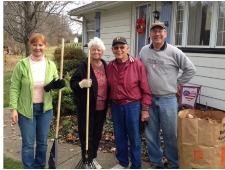
COMMUNITY SERVICE DAY 2012