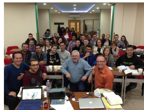
TEACHING MINISTRY STUDENTS IN ALBANIA 2015