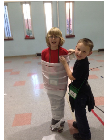
SHINE CHRISTMAS PARTY