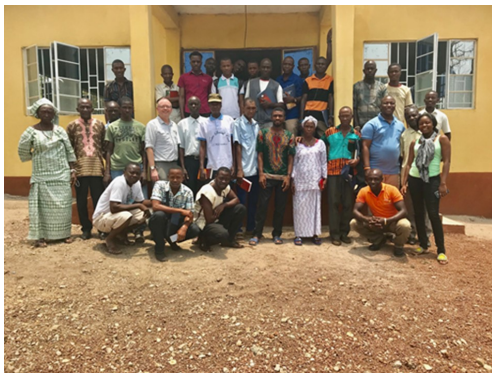
PASTORS & MAPAINDA ELDERS