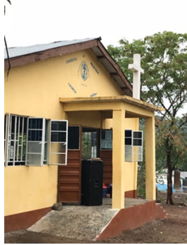
FRONT OF CHURCH