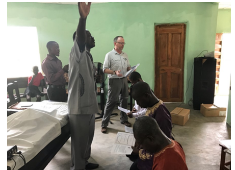
COMMISSIONING OF ELDERS

FEAST FOR FINTONIA MAY 20th at 6:00pm (Dinner $10., Please sign up by May 13th)