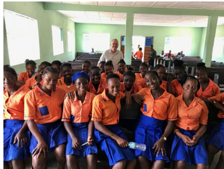
MIDDLE SCHOOL GIRLS