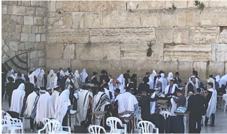
Jewish men praying at Wailing Wall