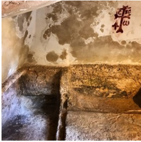
Garden Tomb where Jesus may have been laid