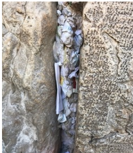
Prayers for Cup Church (long paper on left side) in Western Wall