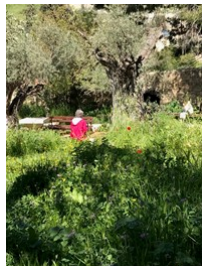
Paula praying in the Garden of Gethsemane