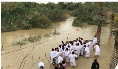
Eastern Orthodox from Poland preparing for baptism in Jordan where Jesus was thought to have done baptisms